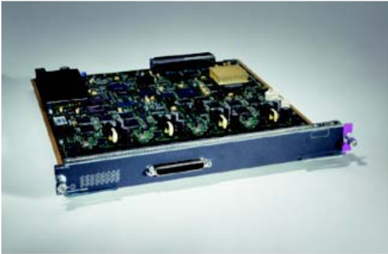
Figure 1 The Catalyst FXS Analog Interface Module enhances the telephony features and functionality of the award-winning Catalyst family of switches.

http://www.cisco.com/en/US/products/hw/modules/ps2797/products_data_sheet09186a0080092370.html